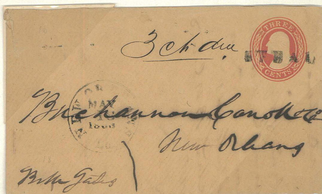
Manuscript "Belle Gates": Sidewheel Packet built 1851 at New Albany, Ind. First home port was Mobile, Ala. Went to New Orleans fall of 52. Manuscript "3 ct due" CDS "NEW ORLEANS / MAY / 18 / 1856 / La". This boat Went to Confederate registry 1861.