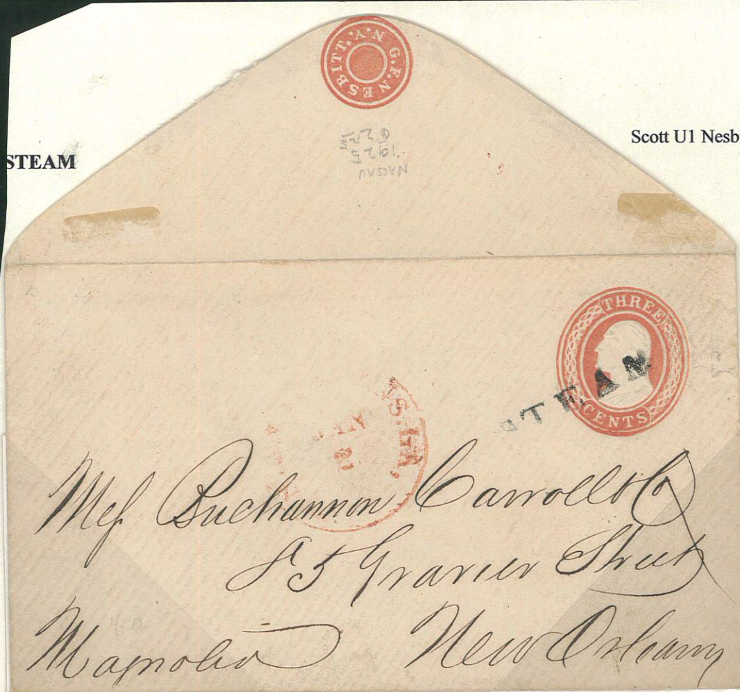
Manuscript "Magnolia": Sidewheel packet built 1845 at Cincinnati, Ohio. Went to New Orleans and ran Mississippi river until July 8, 1855 when it was destroyed by fire with the loss of 8 lives.