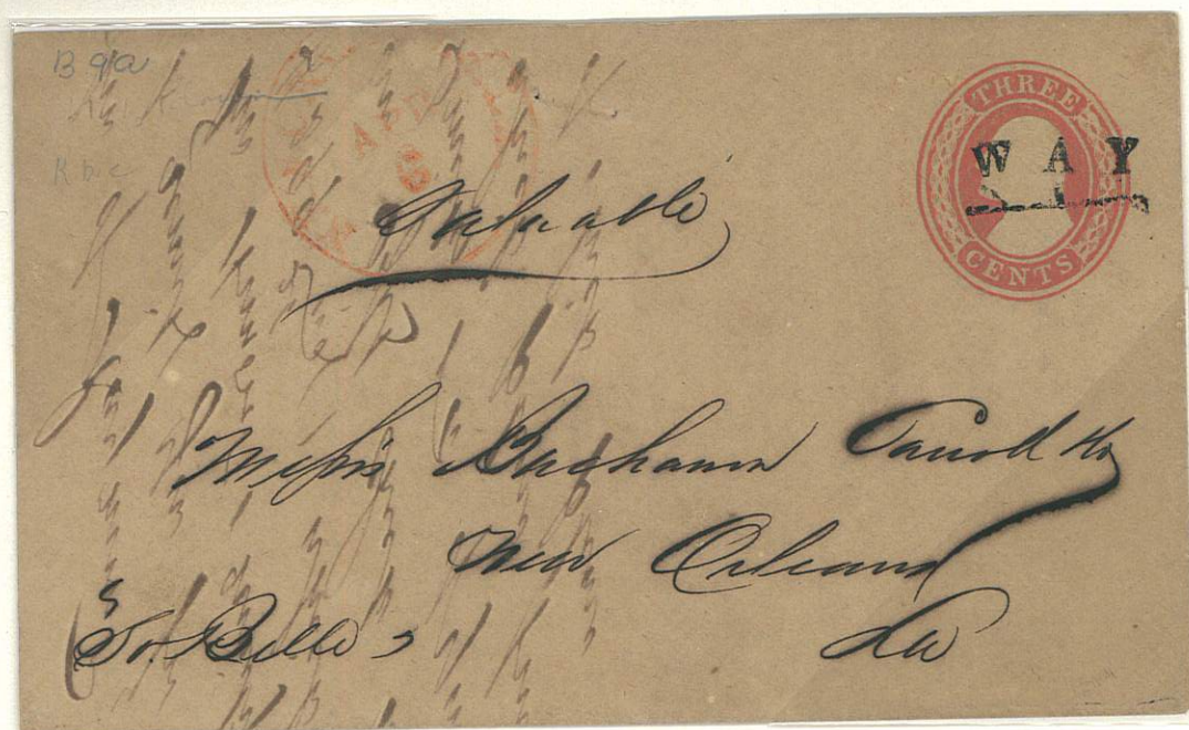
Manuscript "So (Southern) Belle": Sidewheel Packet built 1851 at Jeffersonville, Ind. Enrolled at New Orleans and ran the N. O. - Vicksburg route. Went Coastal to Mobile where it burned Oct. 6, 1857. Its machinery was used in the Steamer Autocrat built 1860 at Paducah, Ky.