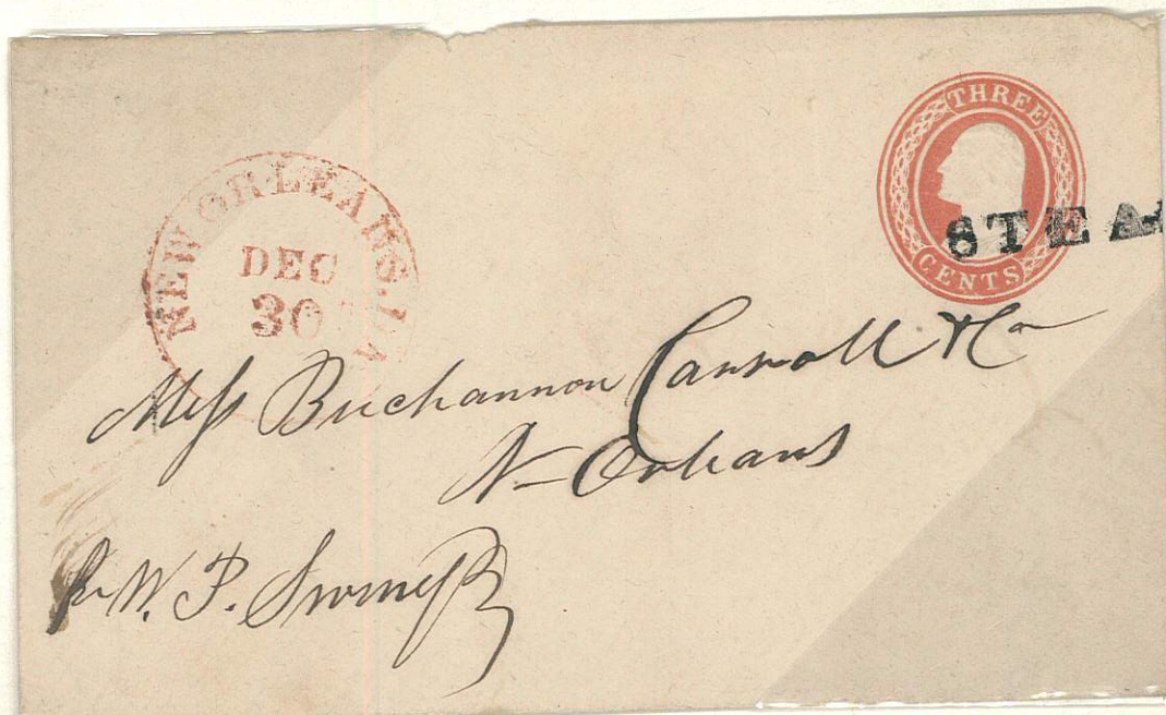
Manuscript "W. P. Swinney": Sidewheel packet built at Jeffersonville, Ind. In 1852. First home port was Vicksburg, Miss. Brought to New Orleans in 1852 and ran New Orleans - Alexandria route. Off the lists 1857.