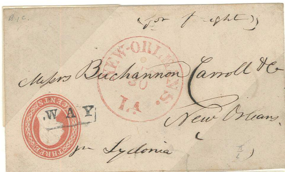
Manuscript "Sydonia": Sidewheel packet built Cincinnati, O. 1851. Ran Mississippi and Red rivers. Burned and lost at Columbia, La. May 29, 1857.