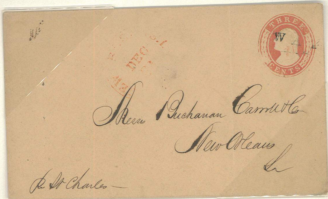
Manuscript "Pr St Charles": Sidewheel Packet built 1849 at Jeffersonville, Ind. First home port was Mobile, Ala. 3c entire (Scott #U8) cancelled by straight line WAY. The Saint Charles went to New Orleans in 1850 and ran the Mississippi and Red rivers. Registered with Confederate Navy 1861.