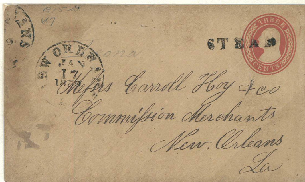
Manuscript "Leona": Sidewheel packet built 1856 at Cincinnati, Ohio. Went to Mobile, Ala. Nov. 11, 1856. Running Alabama rivers until Dec. 1858 when it went to New Orleans. Snagged and lost Dec. 16, 1859 at Coushatta, La.