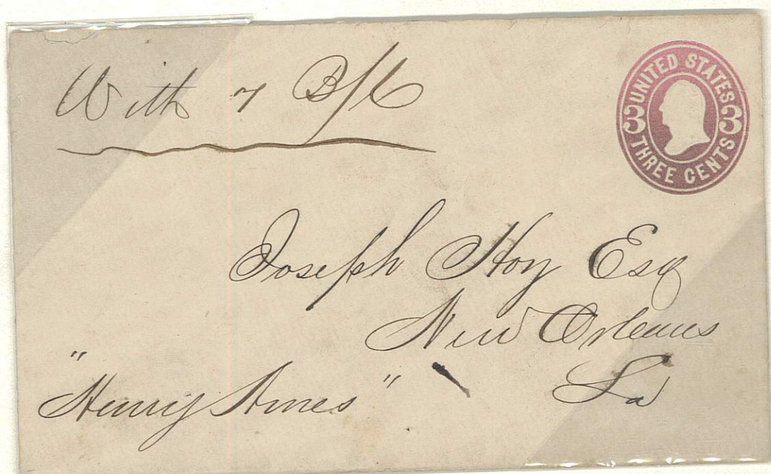
(Steamer) ms Henry Ames : Sidewheel Packet built at Carondelet, Missouri 1864. 3ct stamped envelope. "With B/L" in ms upper left. Patent lined envelope with Lines and "Pat. Nov. 20 1855" on the inside. Ran Saint Louis - N.O. ran the blockade at Columbus, KY. June 1864. Downbound with a gunboat lashed to its shore side, came through Okay. Hit a snag and sunk 7 miles above Cairo July 30, 1864 Raised and back running 1866. Rebuilt 1870. Snagged and lost at Waterproof, La. Aug. 1874 with loss of two lives.