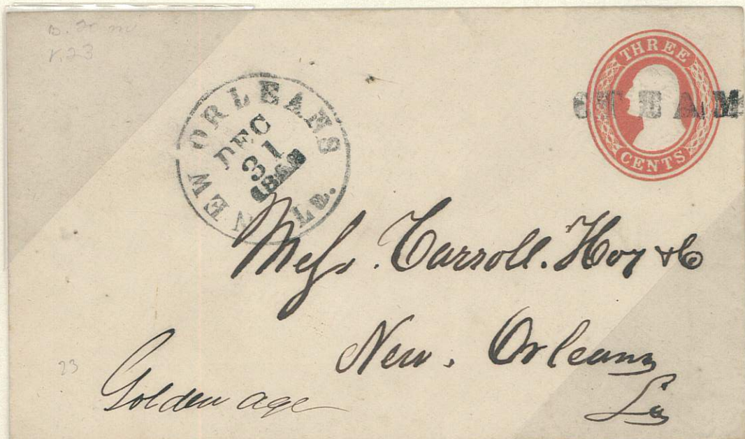
Manuscript "Golden Age": Built 1858 at Pittsburgh, Pa. Ran New Orleans - Baton Rouge - Fort Adams before the war. It was used by the C. S. A. for transport during the war.