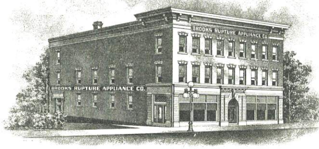
HOME OFFICE - MARSHALL, MICH., U.S.A. OWNED AND ENTIRELY OCCUPIED BY THE COMPANY, LARGEST ESTABLISHMENT OF ITS KIND IN THE WORLD, 15,000 SQ. FT. OF FLOOR SPACE.