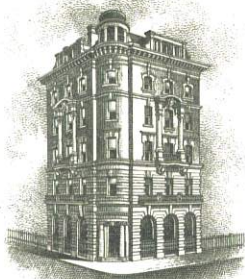
LONDON - ENGLAND KINGSWAY & PORTUGAL ST.