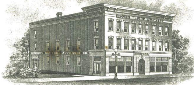
HOME OFFICE - MARSHALL, MICH., U.S.A. OWNED AND ENTIRELY OCCUPIED BY THE COMPANY, LARGEST ESTABLISHMENT OF ITS KIND IN THE WORLD, 15,000 SQ. FT. OF FLOOR SPACE.