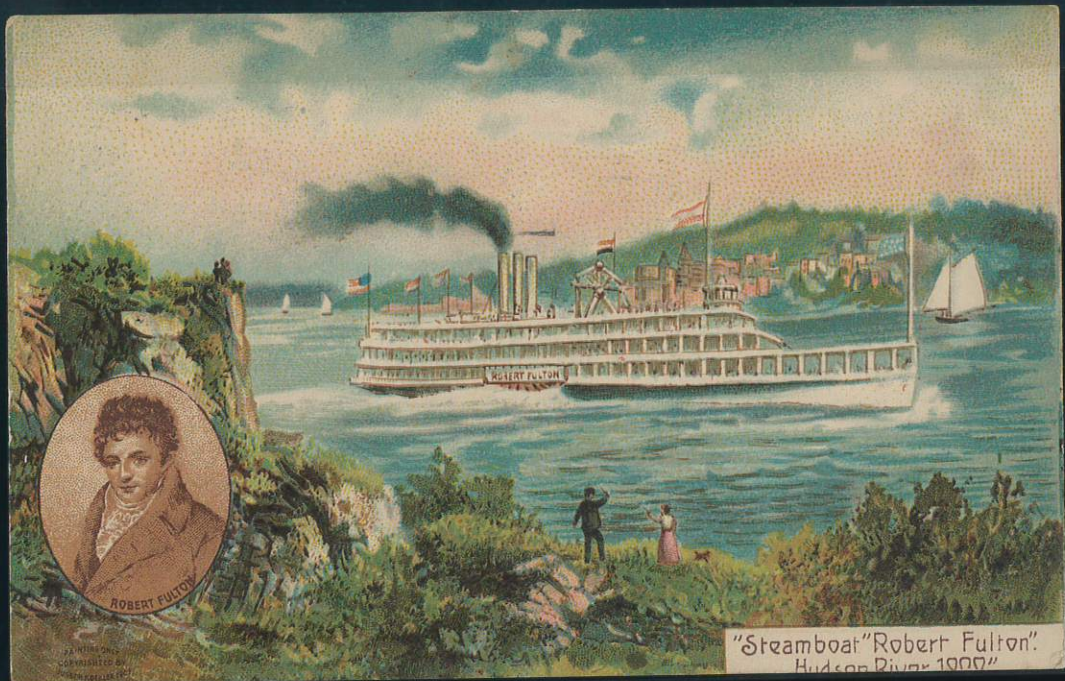
"Steamboat" Robert Fulton. Hudson River 1807