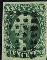
Grid of 4 x 7 squares, Alexandria, VA, PFC