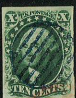
Grid, circular, 7-bar, blue, 17mm, trace of red fin