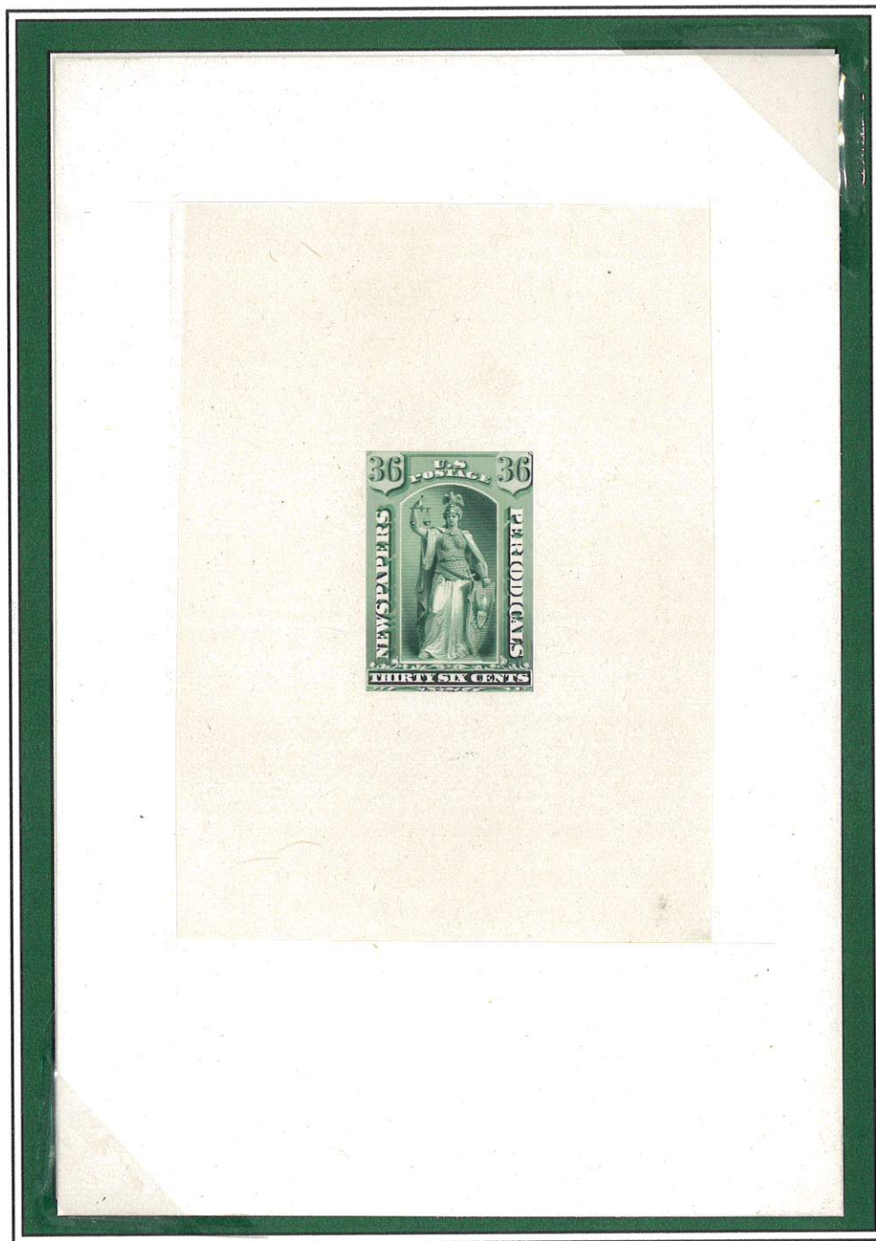
36c Justice (PR18-TC-1)