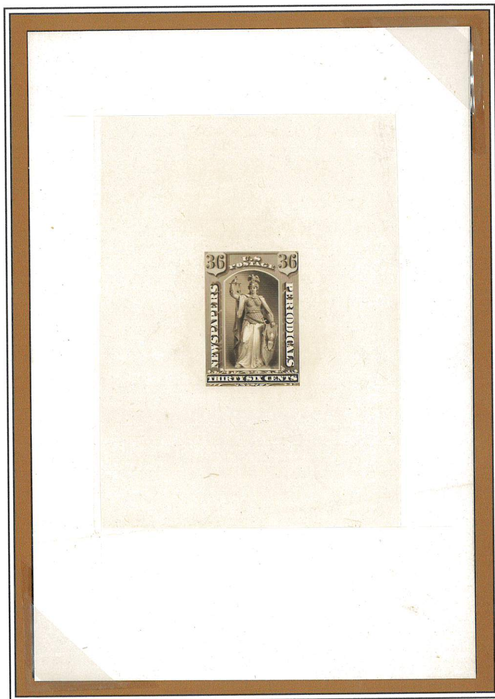
36c Justice (PR18-TC-1)