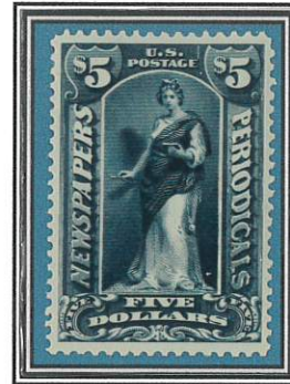
$5 Dark Blue "Clio" (PR121)