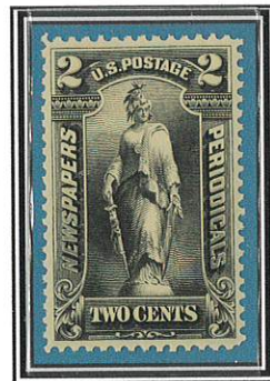
2c Black "Freedom" (PR115)