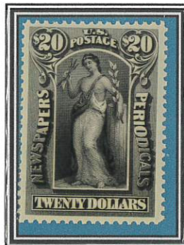
$20 Slate "Peace" (PR123)