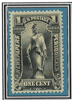
1c Black "Freedom" (PR114)

Bureau of Engraving and Printing Watermarked Paper