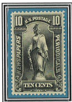
10c Black "Freedom" (PR117)