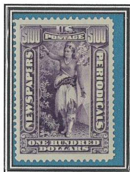
$100 Purple "Indian Maiden" (PR125)