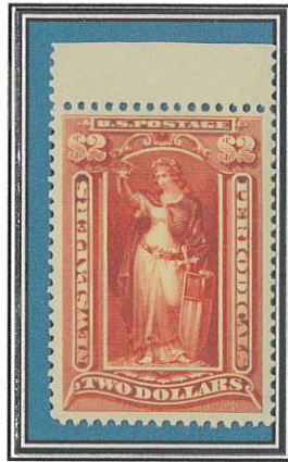
$2 Scarlet "Victory" (PR120)

Bureau of Engraving and Printing Watermarked Paper