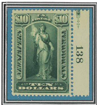
$10 Green "Vesta" (PR122)