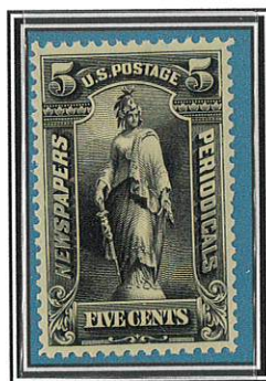
5c Black "Freedom" (PR116)