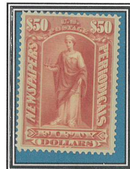
$50 Dull Rose "Commerce" (PR124)