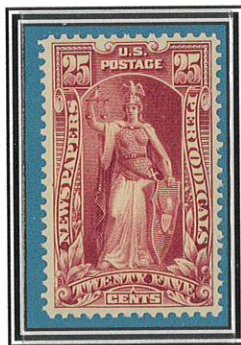
25c Carmine "Justice" (PR118)