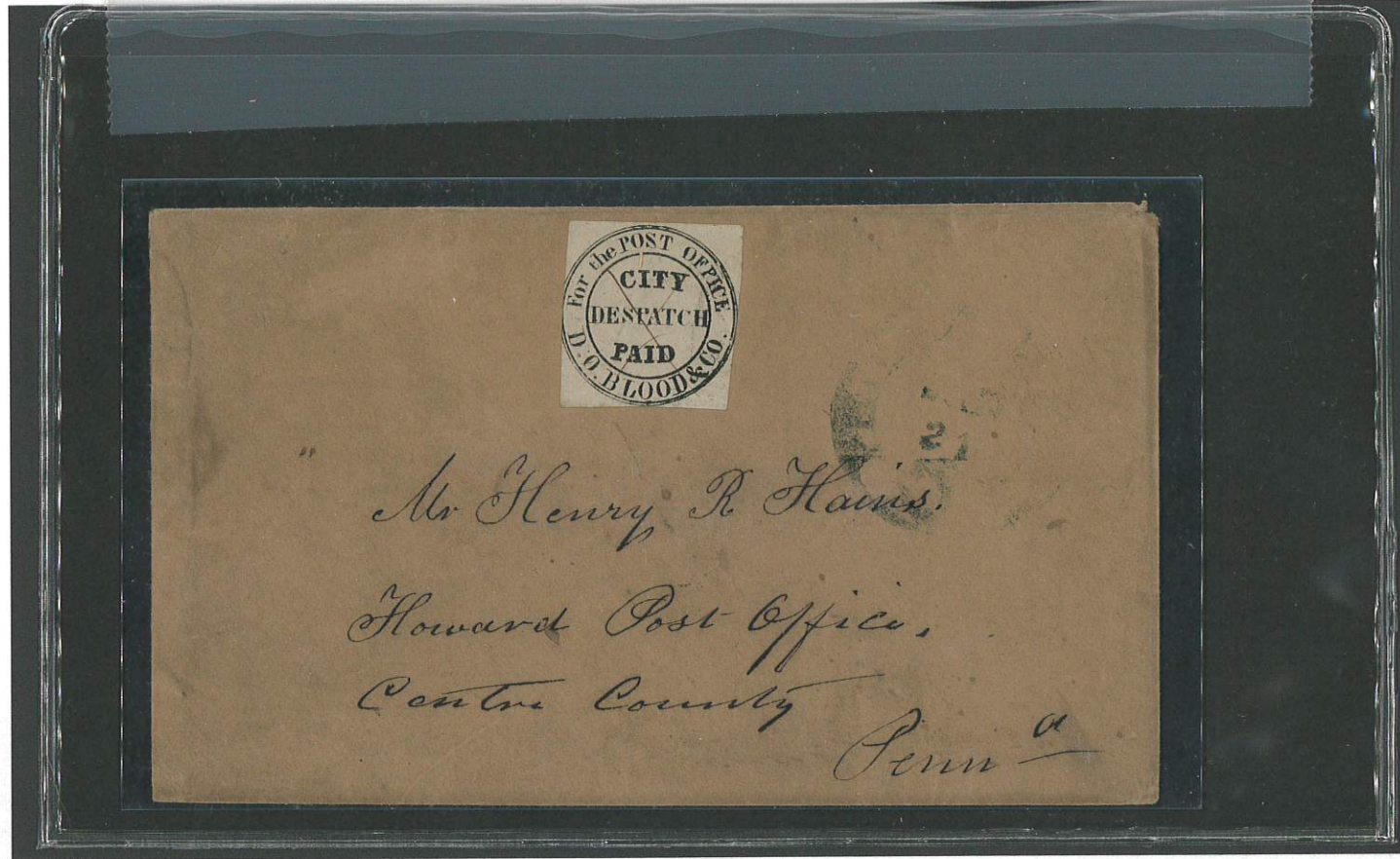
Robert A. Siegel Auction Galleries Inc., 65 East 55th Street, 17th Floor, New York, New York 10022 Phone (212) 753-6421 Fax (212) 753-6429 E-mail: siegelstp@aol.com Website: SiegelAuctions.com/home.htm