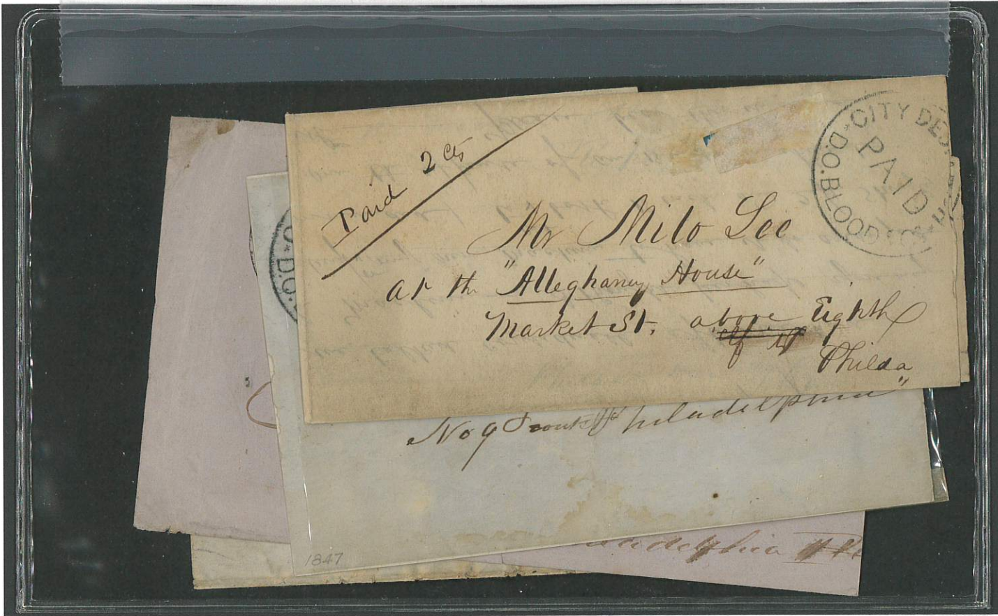
Robert A. Siegel Auction Galleries Inc., 65 East 55th Street, 17th Floor, New York, New York 10022 Phone (212) 753-6421 Fax (212) 753-6429 E-mail: siegelstp@aol.com Website: SiegelAuctions.com/home.htm