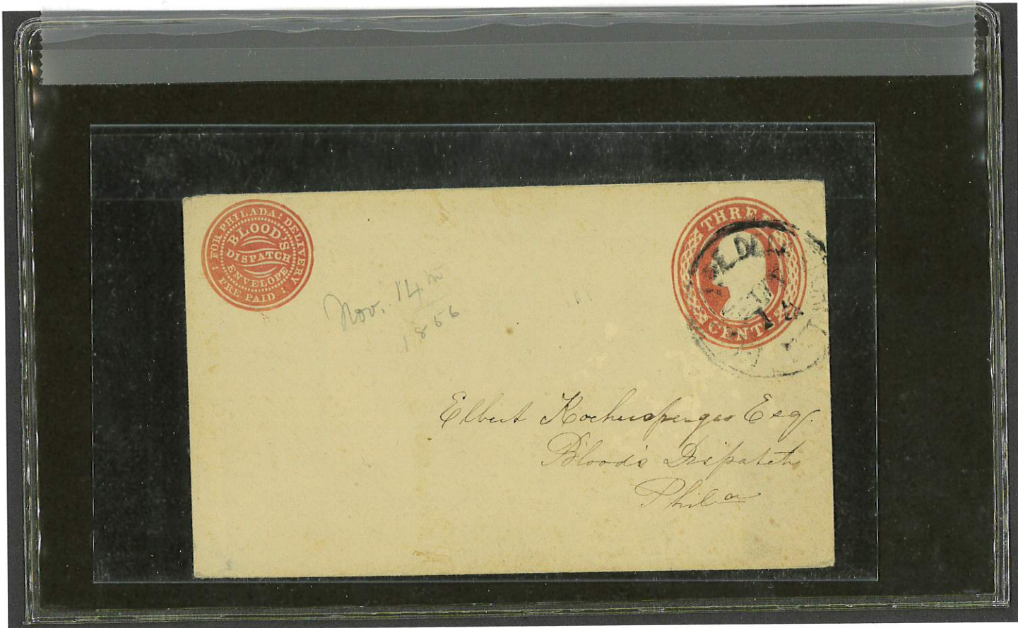
Robert A. Siegel Auction Galleries Inc., 65 East 55th Street, 17th Floor, New York, New York 10022 Phone (212) 753-6421 Fax (212) 753-6429 E-mail: siegelstp@aol.com Website: SiegelAuctions.com/home.htm