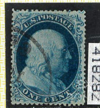
For The Expert Committee Chairman

Photocopies of this Certificate are not valid.