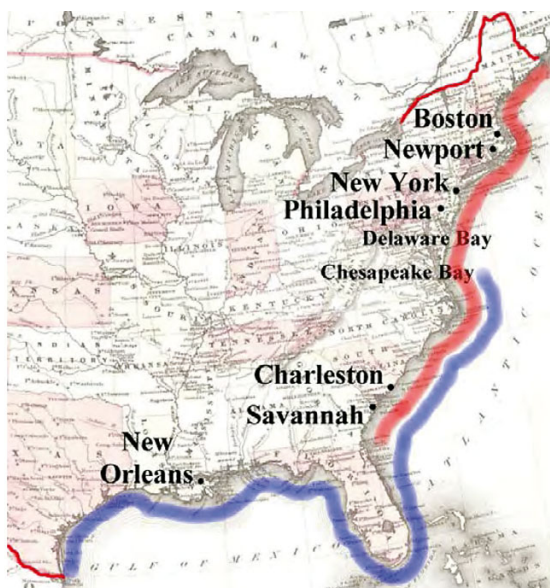
Principal ports of the United States. The red line indicates the coastal area affected by blockades during the Revolutionary War and War of 1812. The blue line indicates the coastal area affected by the Union blockade during the Civil War.